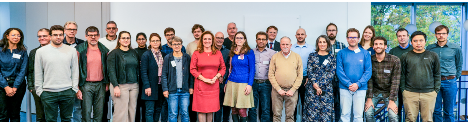
VIPCOAT Consortium Meeting November 2022 in Geesthacht, Germany