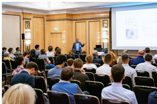
EUROCORR 2022, August 2022 Berlin Germany